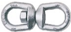
1/4" - 1 1/4" size